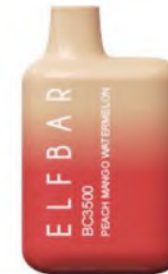
Peach Mango Watermelon