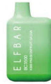
Kiwi Passionfruit Guava