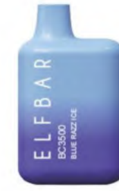
Blue Razz Ice